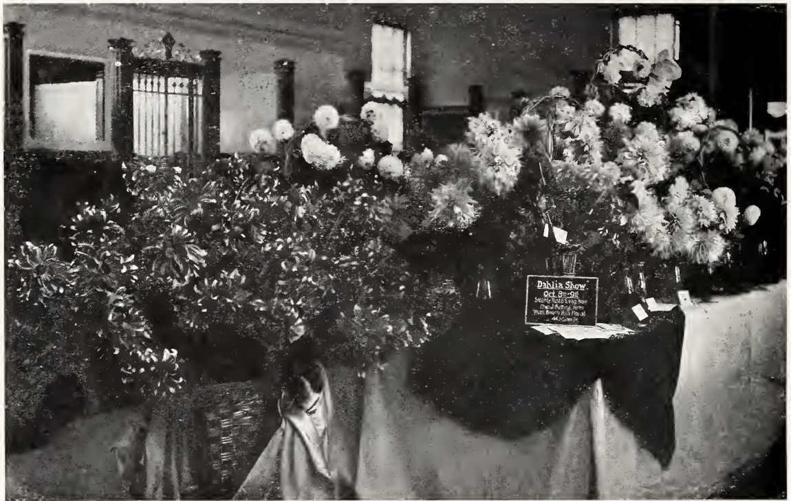
One of our educational Dahlia exhibits. The large vase in the foreground is Bob Pleuse.